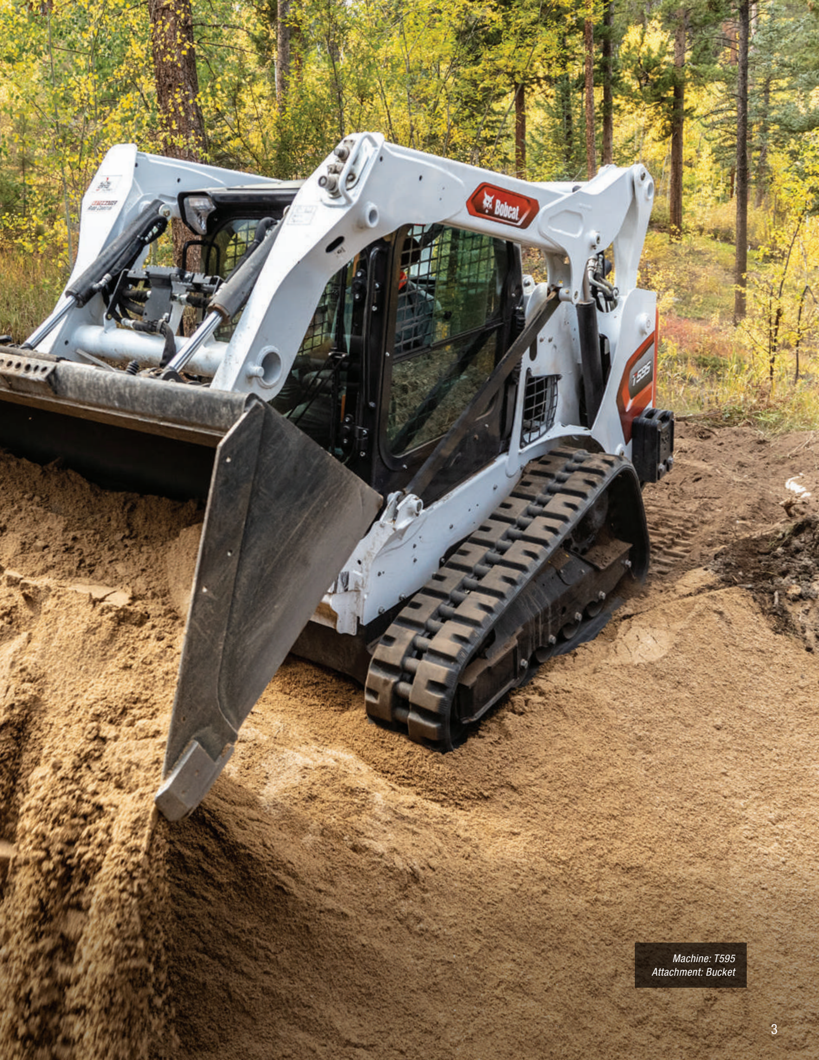
Machine: T595 Attachment: Bucket