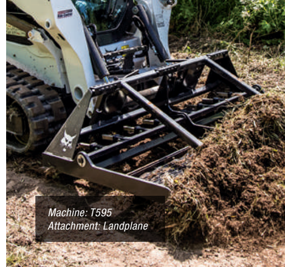
Machine: T595 Attachment: Landplane

Several attachments require control of more than one function. Our small, seven-pin attachment harness activates power and fingertip control functions while eliminating the need for mechanical relays used on other loaders. It's fully integrated with your Bobcat loader for a clean look and protected routing.