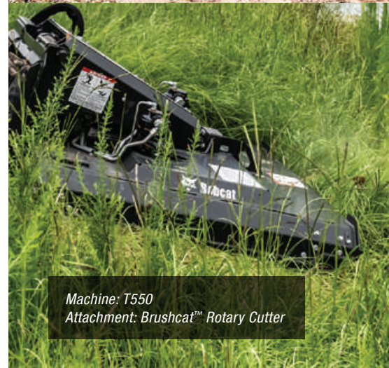
Machine: T550 Attachment: Brushcat™ Rotary Cutter