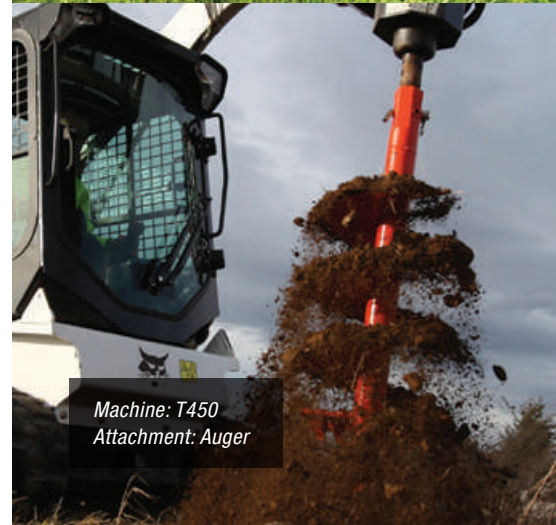
Machine: T450 Attachment: Auger