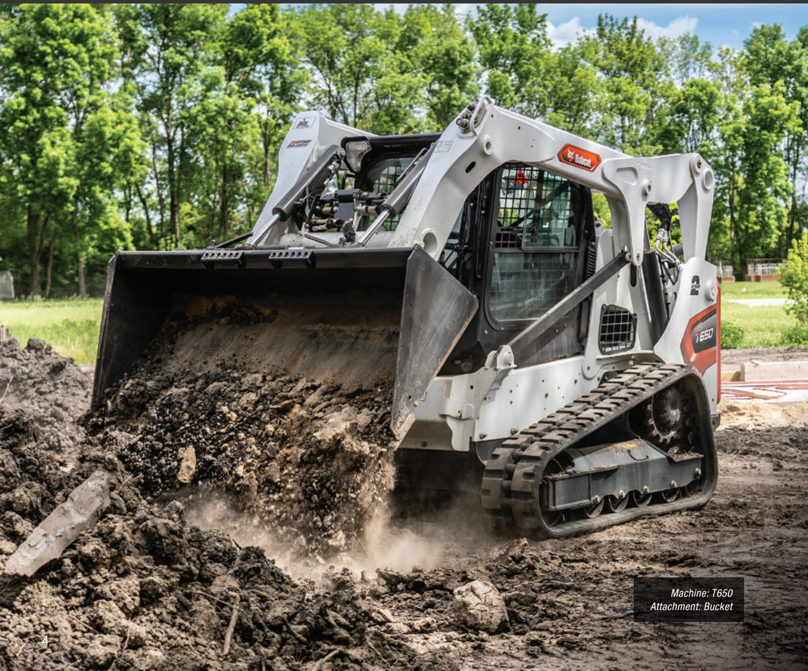
Machine: T650 Attachment: Bucket

Great performance comes from more than just a high-horsepower engine. Bobcat® loaders are designed with a careful balance of engine power, hydraulic pump and cylinder size for faster cycle times. An efficient lift arm design provides powerful breakout forces. If you need to work quicker, lift more and outperform the competition, Bobcat compact loaders are the only choice.