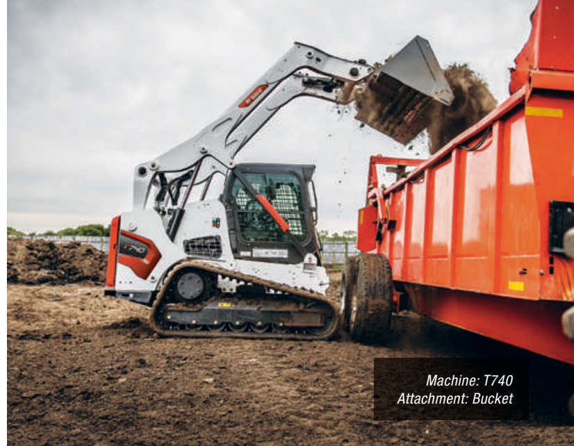
Machine: T740 Attachment: Bucket

The biggest advantage of our Tier 4 solution is simplicity. Bobcat engines meet Tier 4 regulations without a diesel particulate filter (DPF). This reduces downtime that occurs with DPF regeneration and long-term DPF maintenance costs and allows operators to focus on working.