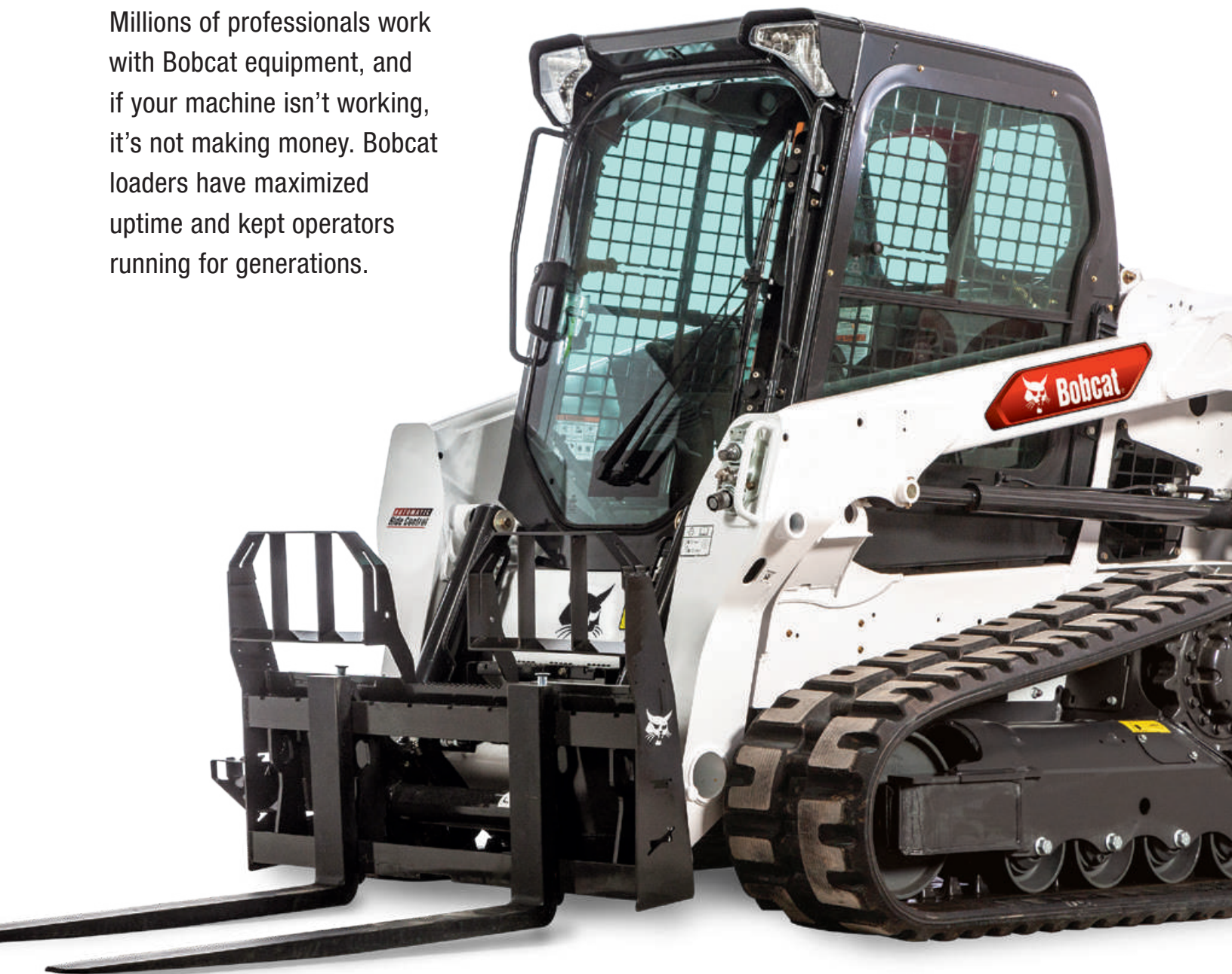
Machine: T550 Attachment: Pallet Fork

Millions of professionals work with Bobcat equipment, and if your machine isn't working, it's not making money. Bobcat loaders have maximized uptime and kept operators running for generations.