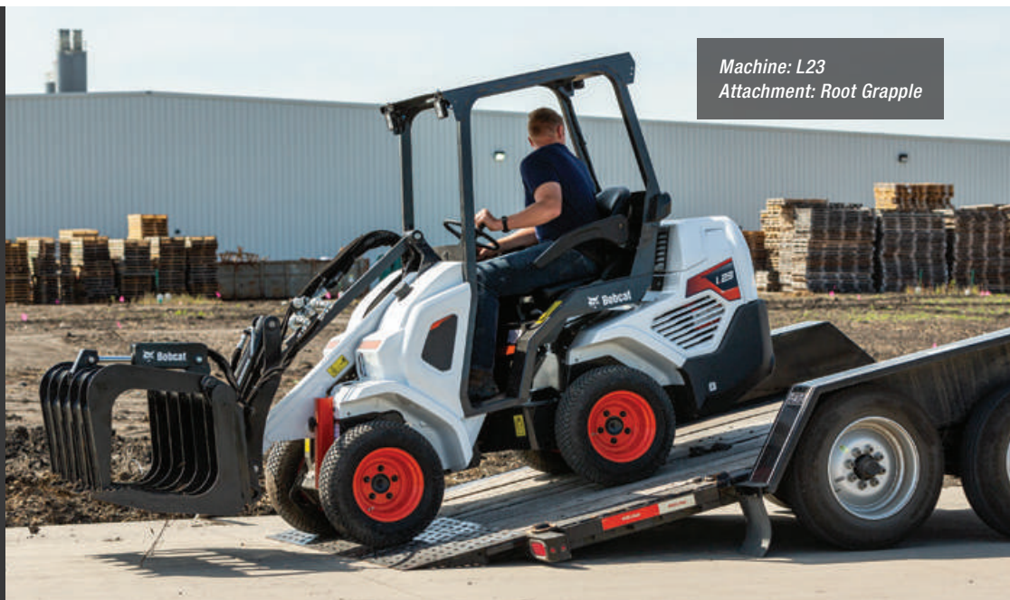
Machine: L23 Attachment: Root Grapple

Small articulated loaders are a highly transportable and relatively lightweight solution that enables you to quickly get your machine to the job and get to work. It will easily fit on pan trailers, dump trailers – and even some enclosed trailers that are utilized for small-frame skid-steer loaders.