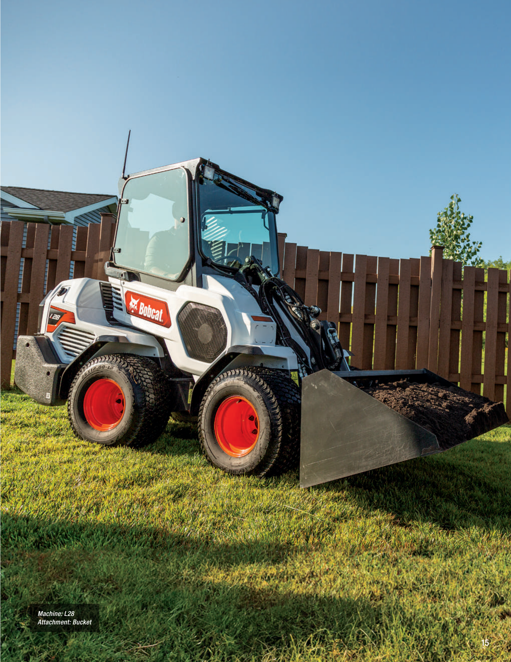
Machine: L28 Attachment: Bucket