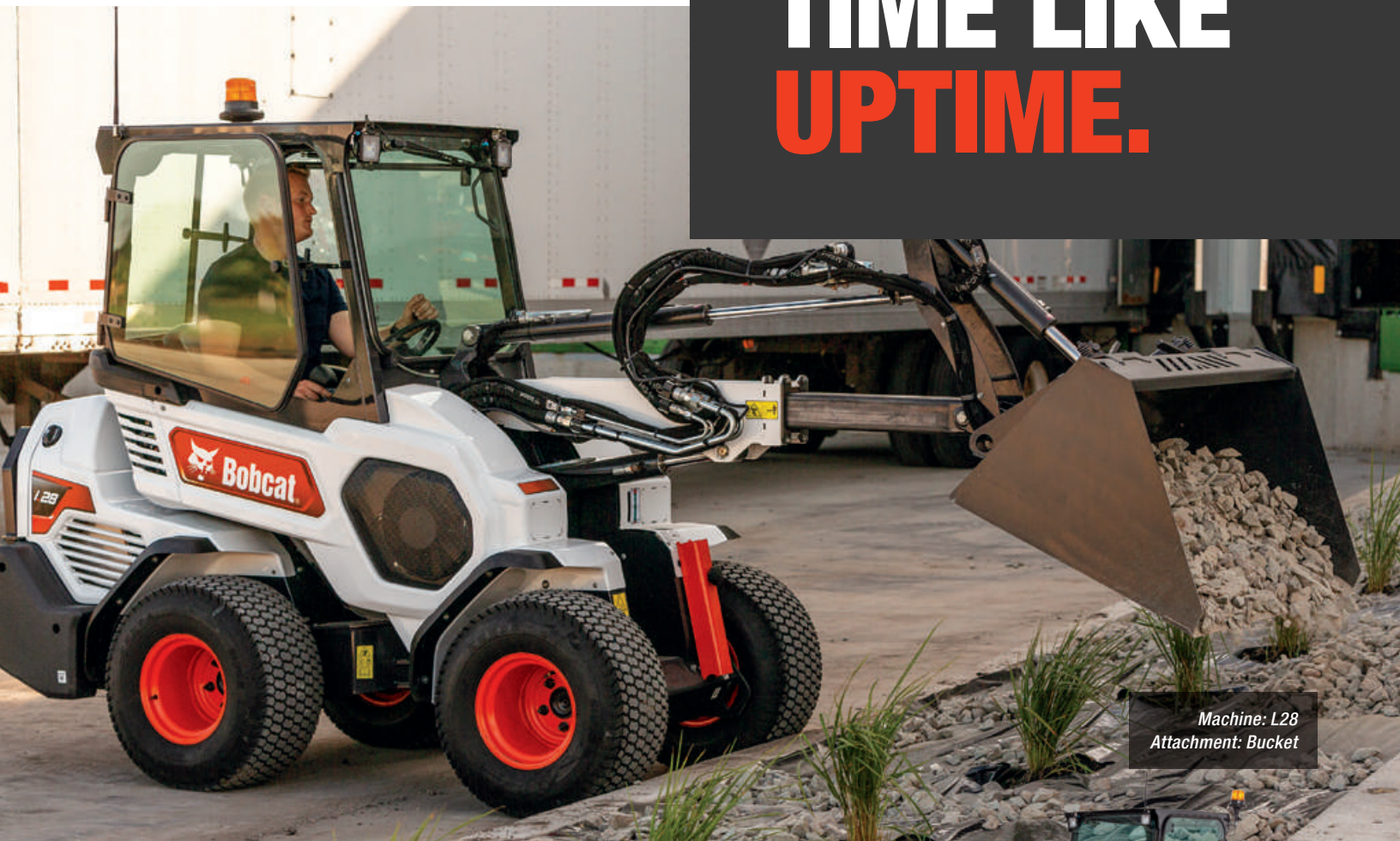
Machine: L28 Attachment: Bucket

When you choose the Bobcat small articulated loader, you'll rest easy with innovative engineering that ensures jobsite obstacles or debris won't slow down your work.