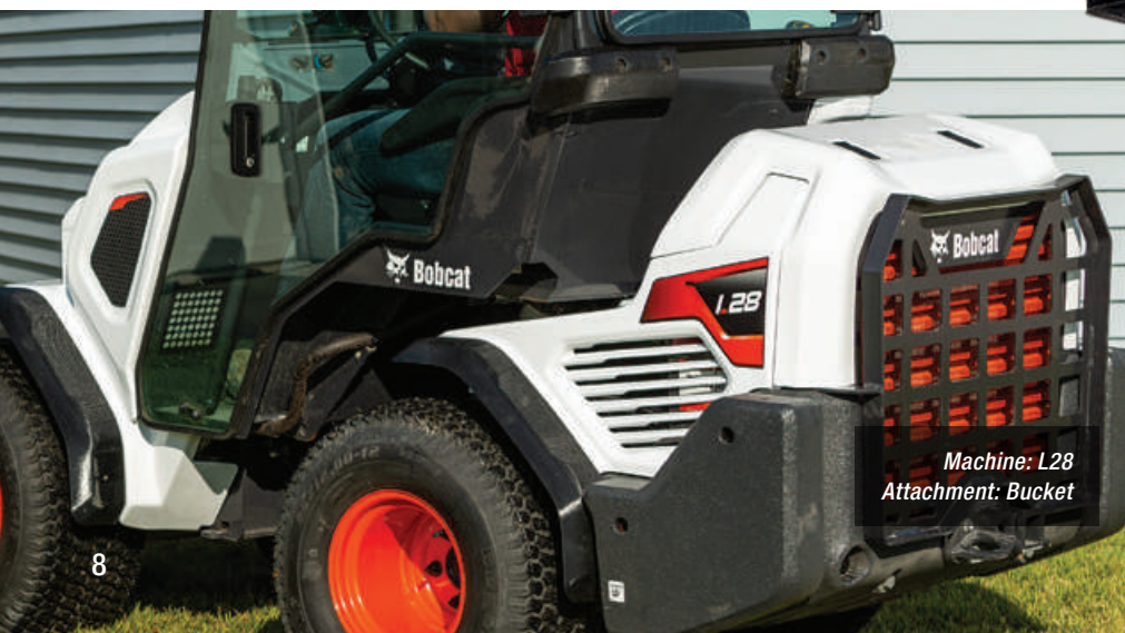
Machine: L28 Attachment: Bucket