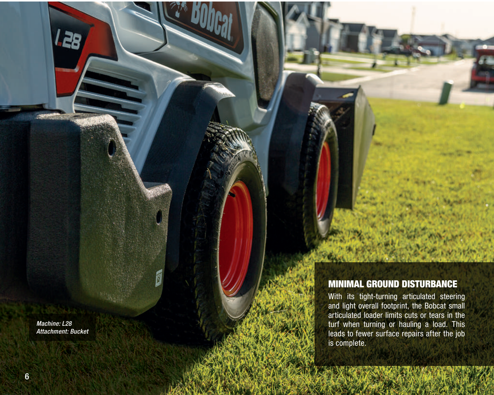
Machine: L28 Attachment: Bucket

The Bobcat small articulated loader has a hydraulic drive system that allows the machine to keep moving in rough or uneven terrain.