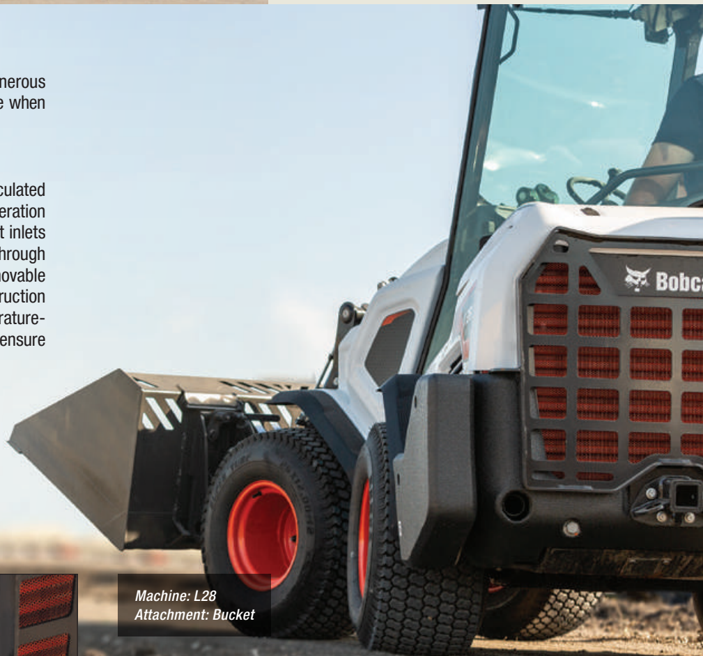
Machine: L28 Attachment: Bucket

With an efficient cooling system, Bobcat small articulated loaders offer leading performance for improved operation along with great component protection. Side and front inlets bring cool air into the engine compartment and send it through the screened rear exit. The rear radiator screen is removable for easy cleanout, and its corrugated steel construction provides excellent durability. A separate temperature-controlled hydraulic oil cooler operates as needed to ensure quieter operation as well.