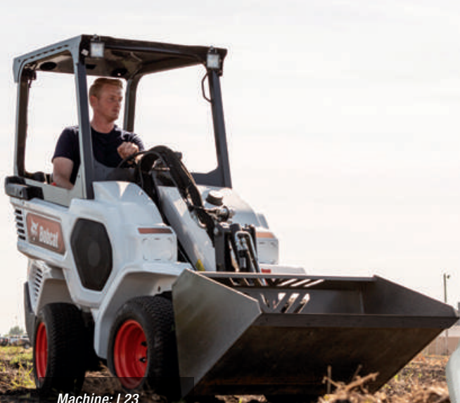
Machine: L23 Attachment: Bucket