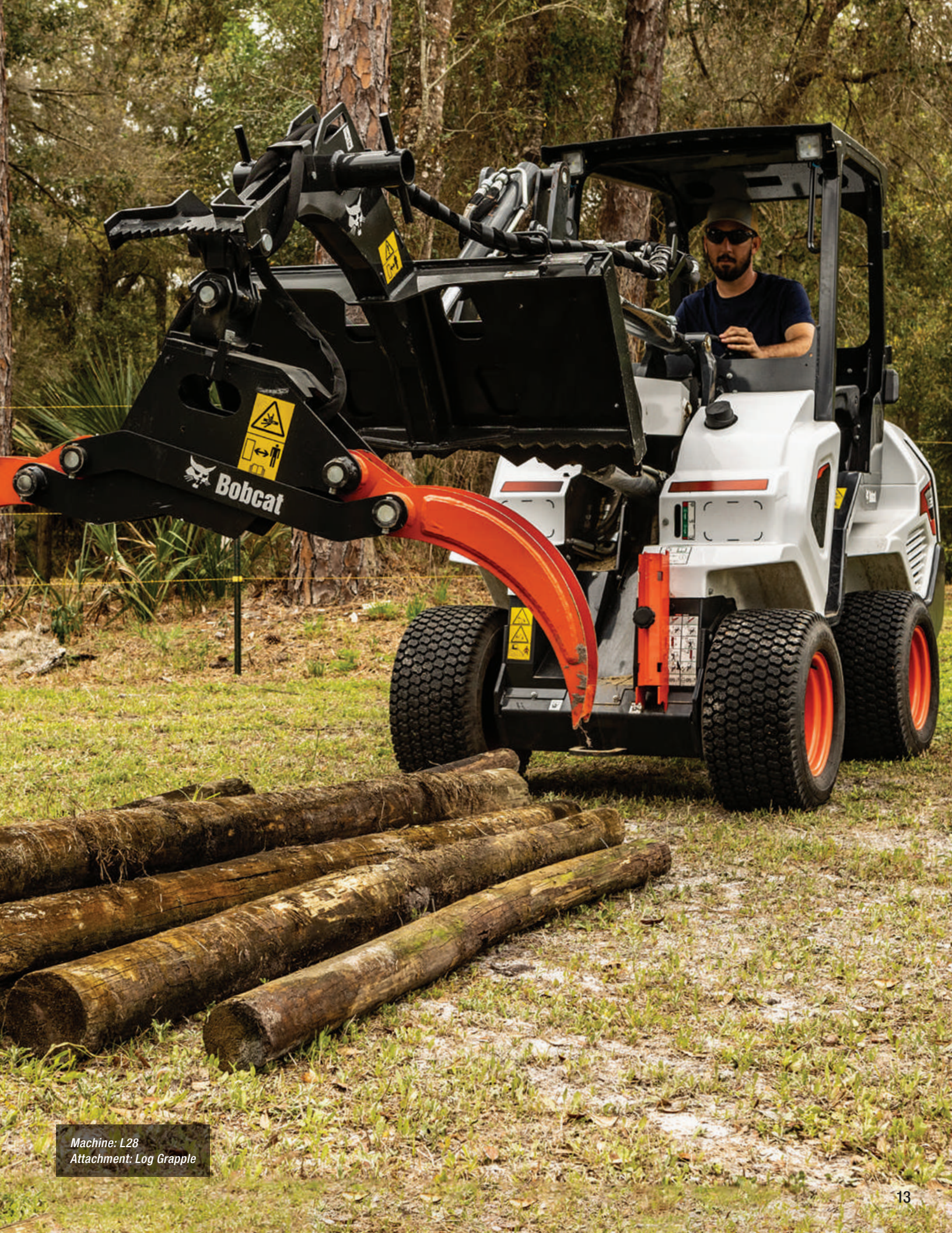
Machine: L28 Attachment: Log Grapple